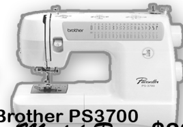
Brother PS3700 Floor Model Price: $299 BRAND NEW Price: $319

We sell sewing supplies and yarn for knitting or crochet! NYC's BEST fashion sewing classes!