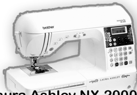
Laura Ashley NX-2000 BRAND NEW Price: $1899