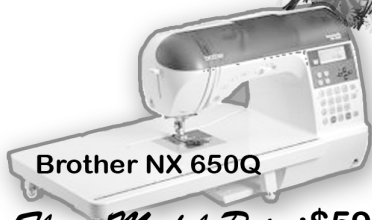
Brother NX 650Q Floor Model Price: $599 BRAND NEW Price: $999