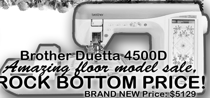
Brother Duetta 4500D Amazing floor model sale, ROCK BOTTOM PRICE! BRAND NEW Price: $5129