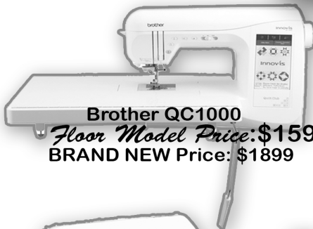
Brother QC1000 Floor Model Price: $1599 BRAND NEW Price: $1899