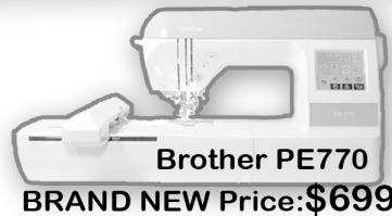
Brother PE770 BRAND NEW Price: $699