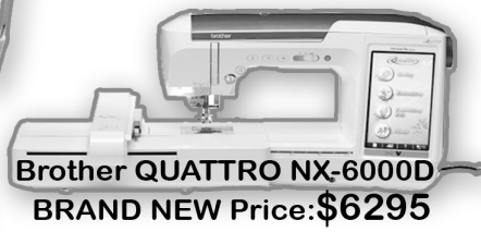
Brother QUATTRO NX-6000D BRAND NEW Price: $6295